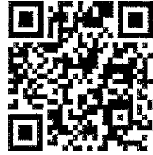
DATCP Tourist Rooming House

The below QR Code will take you the DATCP's website on Tourist Rooming Houses for an inquiry form to complete and information on licensing requirements, fees and inspections.